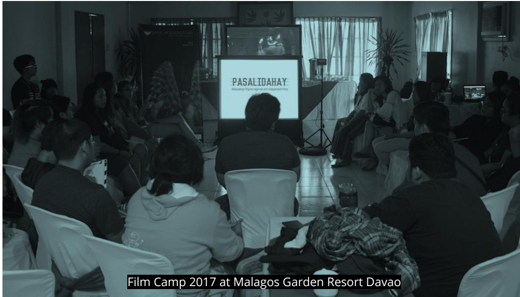
Film Camp 2017 at Malagos Garden Resort Davao