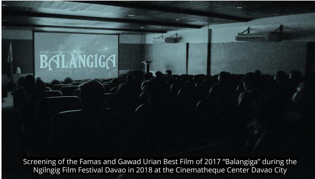
Screening of the Famas and Gawad Urian Best Film of 2017 "Balangiga" during the Ngilngig Film Festival Davao in 2018 at the Cinematheque Center Davao City