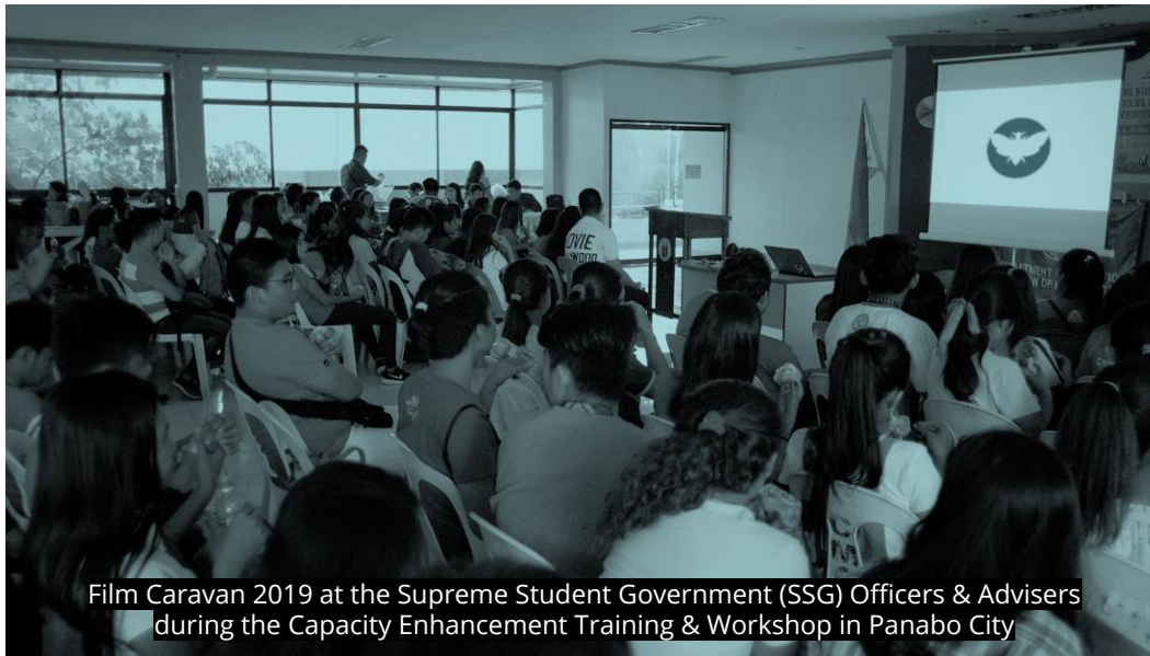
Film Caravan 2019 at the Supreme Student Government (SSG) Officers & Advisers during the Capacity Enhancement Training & Workshop in Panabo City

FILM CARAVAN , educational film screenings and forums in schools and in the community, happening on June to September 2019.